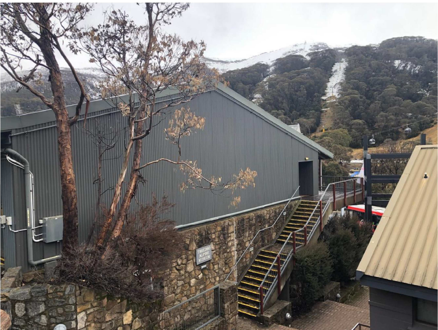
SOUTH-WEST ELEVATION ALPINE HOTEL